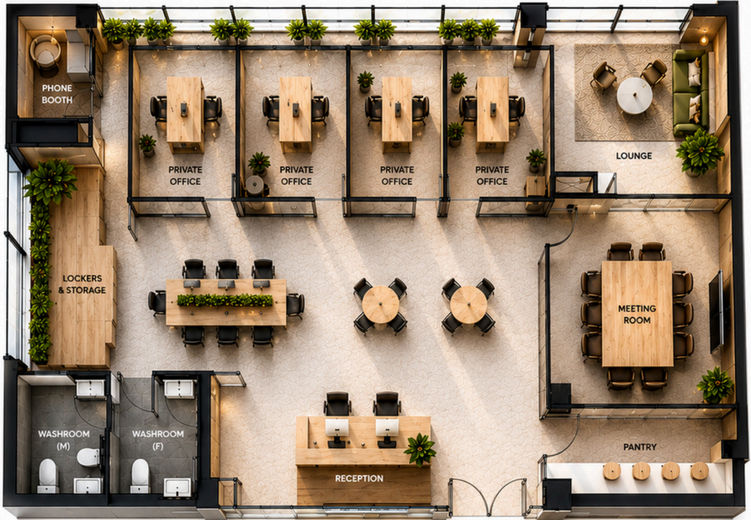
FLOOR PLAN REFERENCE

Magnet Work's Private Offices offer fully enclosed, secure workspaces tailored for privacy, concentration, and professional collaboration. Suitable for businesses, startups, and teams requiring confidentiality and operational independence, these offices combine exclusivity with the advantages of a premium coworking ecosystem.